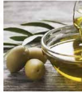
Natural Oils and Butters